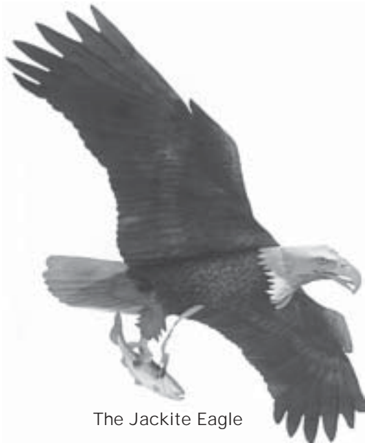
The Jackite Eagle